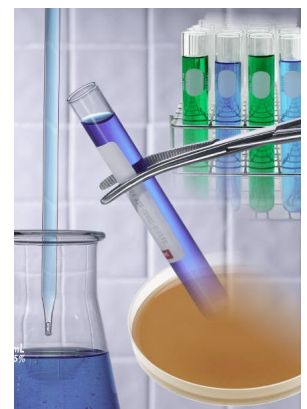
We have been cooking up some new high tech features that will equate to savings!

The GUI client enables full use of the touch screen, use of color and images to support your applications. Sometimes color alone will improve user efficiency since red can depict an error situation and green can imply continue, all is