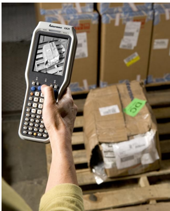
Graphical clients are now the standard rather than the hard to reach option.